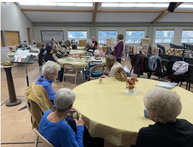
Luncheon with UWIF (formerly UMW) . The Ladies meet once a month on the First Wednesday of the month for a luncheon, fellowship and a program.