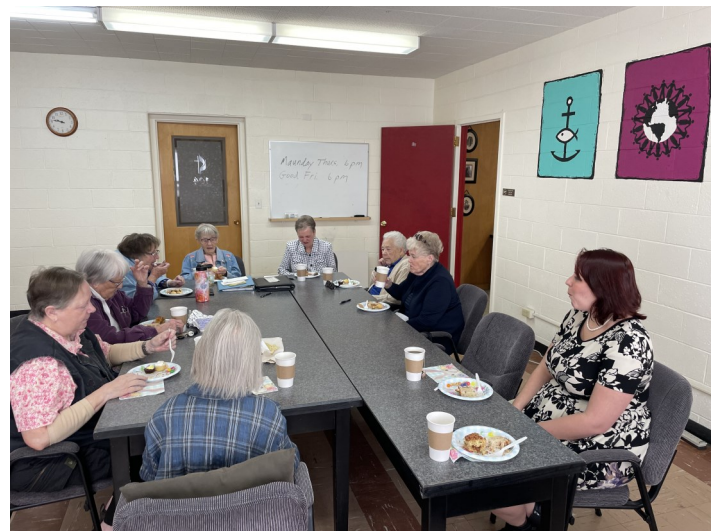
Sunshine Circle meets at 9:30 AM on the 3rd Wednesday of the month in room 104. They have a treats, fellowship and a program provided by one of the Circle members.